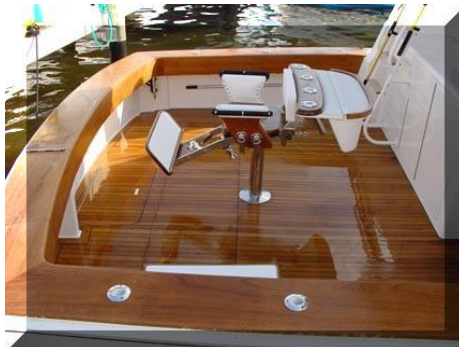
Teak boat decking

etc.), where it will resist water and retain its strength.