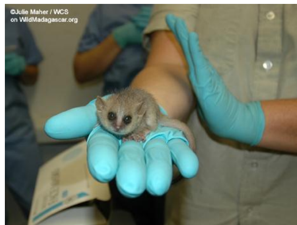
Gray Mouse-lemur recently born in captivity at the Bronx Zoo in New York. Zoos will play an increasingly important role in the future