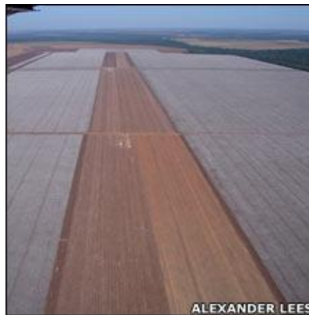
Soy plantations did not provide long-term benefits in this study

One of the aspects of the new treaty will be a mechanism that rewards local communities for keeping carbon-absorbing forests intact - a mechanism known as REDD (Reducing Emissions from Deforestation and forest Degradation).