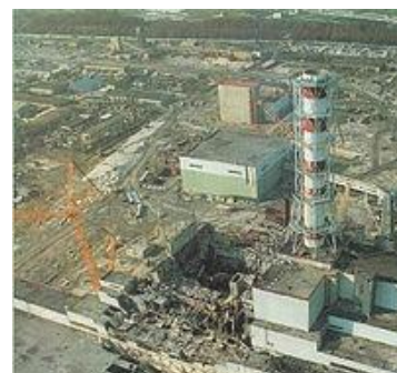
The nuclear reactor in Chernobyl after the disaster. From 1986 to 2000, 350,400 people were evacuated and resettled from the most severely contaminated areas of Belarus, Russia, and Ukraine.

An uncontrolled nuclear reaction in a nuclear reactor can potentially result in widespread contamination of air and water with radioactivity for hundreds of miles around a reactor. Some serious nuclear and radiation accidents have occurred. Nuclear power plant accidents include the Chernobyl disaster (1986), Fukushima Daiichi nuclear disaster (2011), and the Three Mile Island accident (1979).