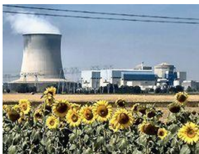
A nuclear power station with adjoining cooling vent.

Nuclear power stations have been making electric power for over 50 years. Nuclear power is very efficient. For example, one of those small uranium pellets can produce as much electricity as 150 gallons of oil. Just one nuclear station can provide enough power for a city. Many people see nuclear power as an alternative energy source.